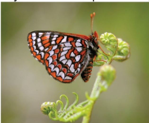
Taylor's checkerspot butterfly