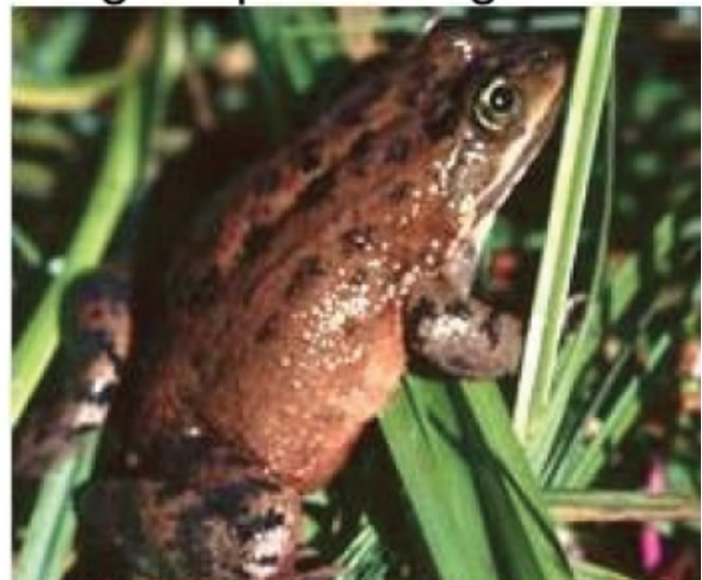
Oregon spotted frog