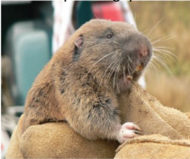
Mazama pocket gopher