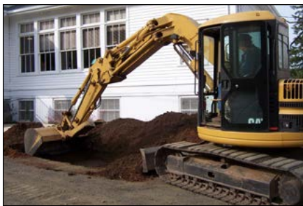
Figure 10A. Mix compost into the soil as deeply as possible. Add about \frac{1}{3} compost by volume. For large areas or areas with compacted soil, consider heavy equipment.

Mix compost into the soil as deeply as possible (Figure 10A). Add about \frac{1}{3} compost by volume. So, if you can dig 2 feet deep with a tractor, you could add compost up to 1 foot deep. Incorporate the compost into the existing soil (Figure 10B).