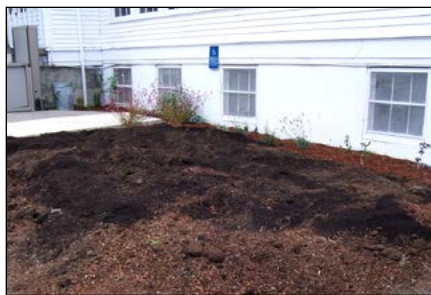
Figure 10B. The planting bed after being amended with compost, which was mixed deeply into the soil.