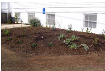
Figure 10D. Landscape plants after being installed in the fall. The plants were watered at the time of planting.