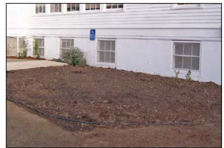
Figure 10C. The landscape bed ready for planting.