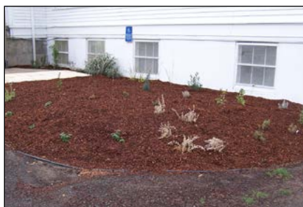
Figure 10E. Mulch was applied to the surface. Mulch helps to conserve water in the soil and keeps weeds from germinating.