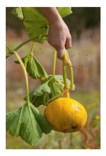
Figure 3. Freshly harvested pumpkin.