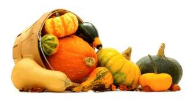
Figure 1. Acorn squash.