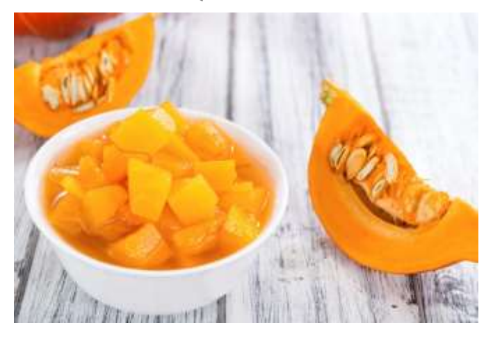
Figure 5. Cubes of canned pumpkin ready to be consumed.