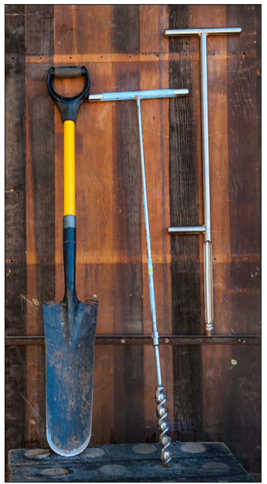
Figure 3. Soil sampling tools.