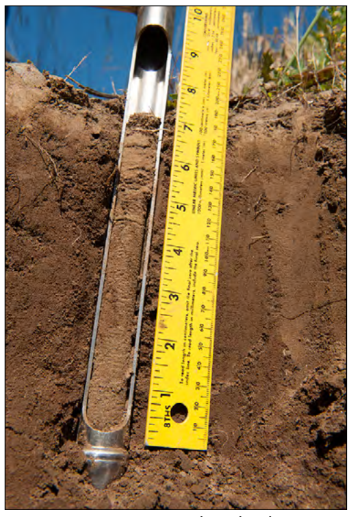
Figure 4. Measuring sampling depth.