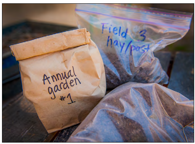
Figure 6. Take a photo of your sample bags before you mail them, for future reference. Do not use a paper bag unless the lab provides one lined with plastic.