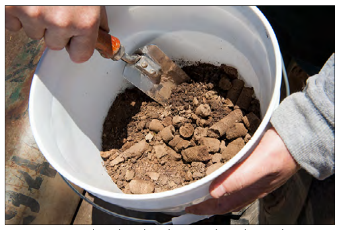
Figure 5. Use a clean hand tool to mix the subsamples.

Once you have researched and selected a laboratory, plan to use the same lab for future tests to keep sample analysis consistent and detect changes in soil nutrients. Also, plan to take your soil sample at the same time of year, same depth, and same approximate field location.