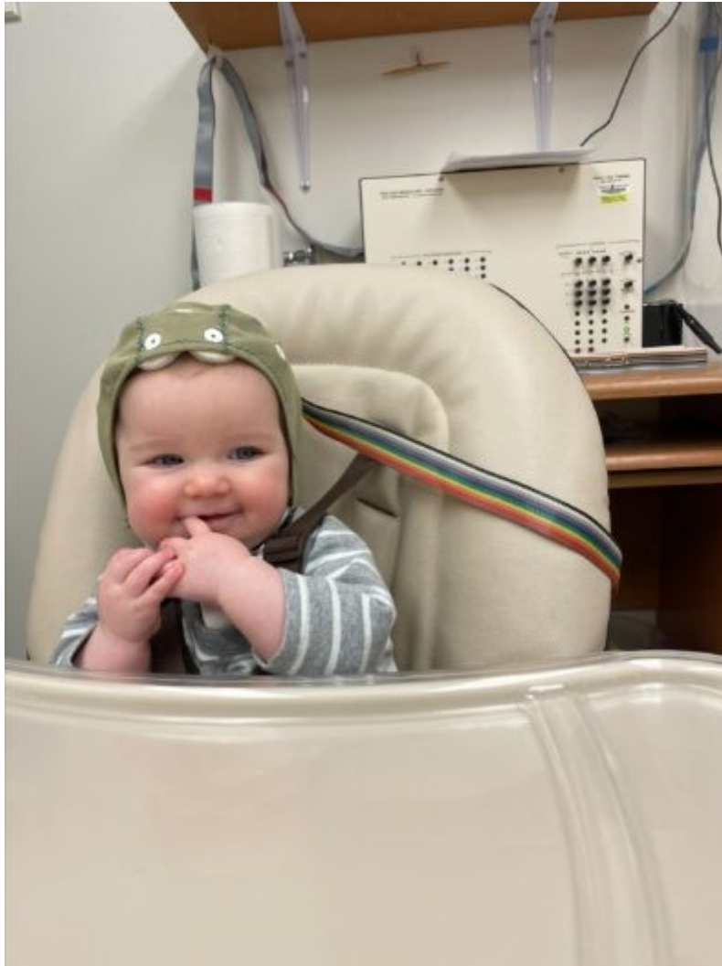
Babies in Gartstein's lab wear special caps that measure their brain activity while they play games.

Some babies cry when they experience new things and meet new people. Some crying babies are easy to distract. Some seem like they won't stop crying no matter what you do.