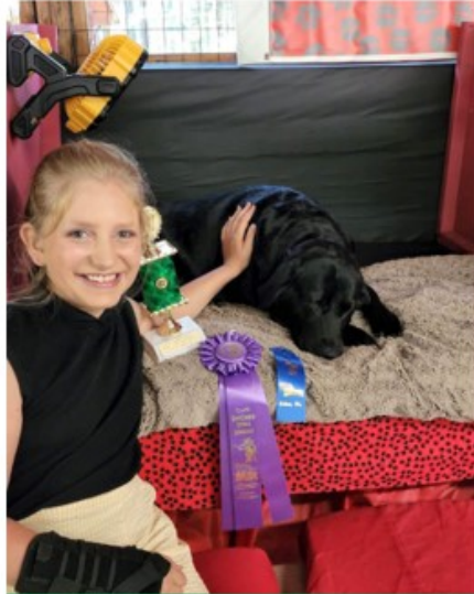
Washington State 4-H