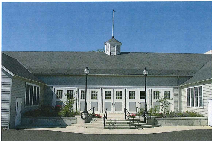
The old, and.....

The Ensminger Pavilion cupola restoration was completed on August 20. Kudos to the Facilities Services shops.....Carpenters, Roofers and Painters.....for a nice job!