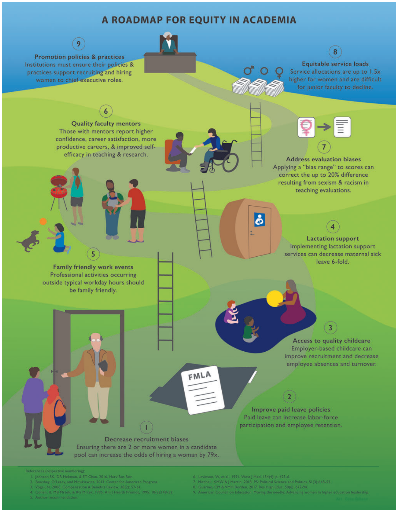
FIG. 1. A roadmap for equity in academia. Color images are available online.