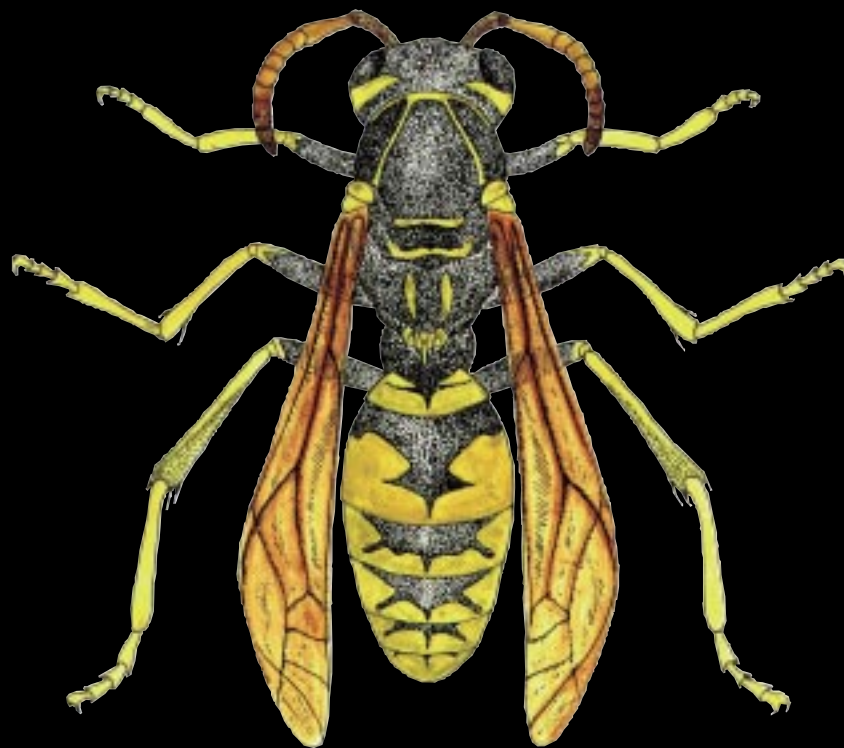
Paper Wasp Polistes