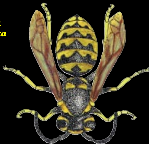
Western Yellowjacket Paravespula pensylvanica