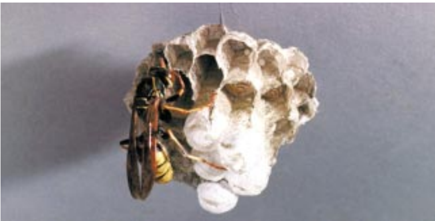
Paper wasp queen, Polistes aurifer (= fuscatus aurifer ), tending aerial nest.

A typical yellowjacket worker, Vespula pensylvanica , is shown on the cover. Yellowjacket workers are about 1/2 inch long, and appear short and stocky. All yellowjackets are yellow and black or white and black. Paper wasps are up to 3/4 inch long, and are more slender (see cover). Paper wasps may be distinguished from yellowjackets by their more slender body shape