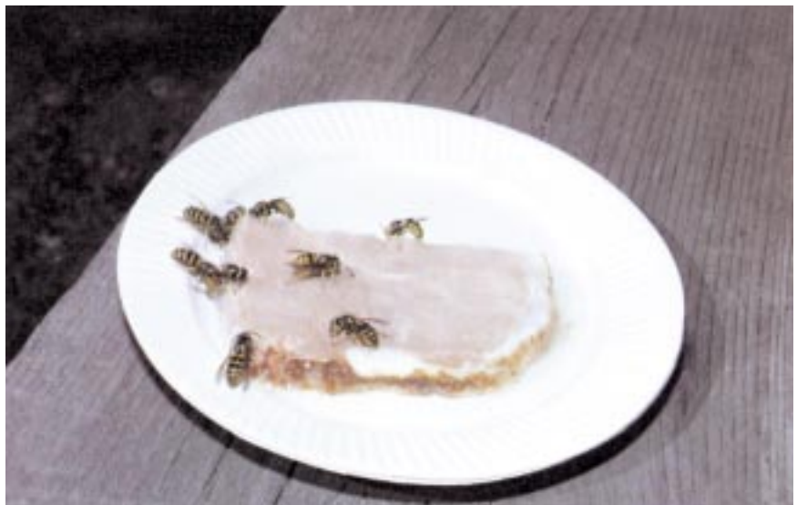
Western yellowjacket workers often scavenge for meat or sweets at picnics. Workers will feed pieces of meat to developing larvae in the nest.

Underground nests. Use a registered hornet and wasp spray. Direct the material into