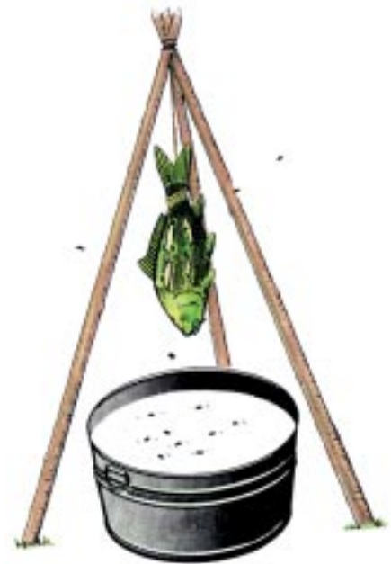
Suspended fish bait trap.