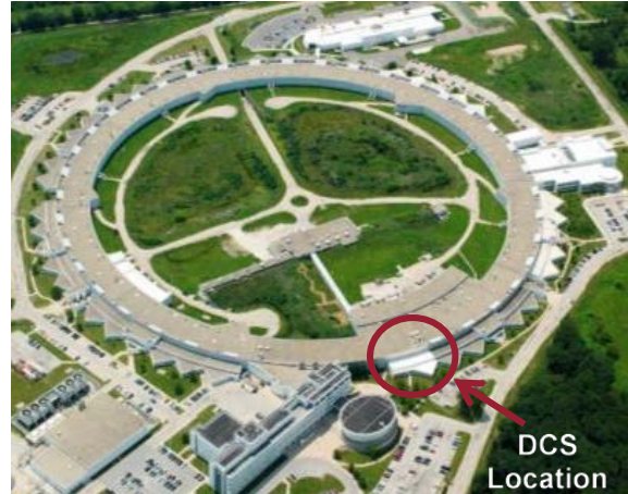
Advanced Photon Source

Washington State University (WSU) is seeking to hire a strongly self-motivated talented Laser Engineer to support the laser-shock experiments at a first-of-a-kind experimental capability: The Dynamic Compression Sector (DCS) at the Advanced Photon Source (APS), Argonne National Laboratory. The DCS constitutes a new paradigm for understanding the dynamic compression and deformation response of materials under extreme conditions. Real-time, atomistic-scale investigations of condensed matter phenomena can be undertaken in single event experiments through time-resolved, in-situ measurements utilizing the tunable, high energy X-ray capabilities at the APS.