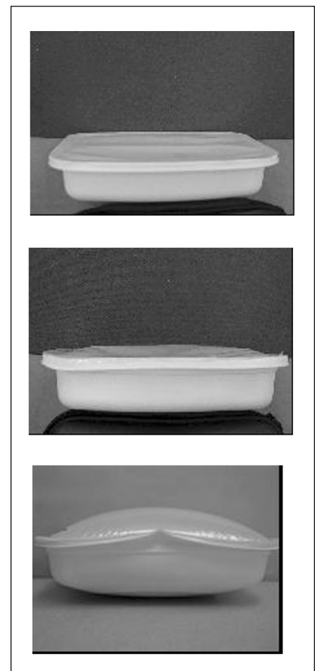
Figure 2—Visual observation of package integrity of typical food trays. (a) Food tray prior to MCWCV heat treatment. (b) Properly processed tray after 3-mo incubation at 37 °C. (c) Underprocessed tray stored for 3 mo at 37 °C.