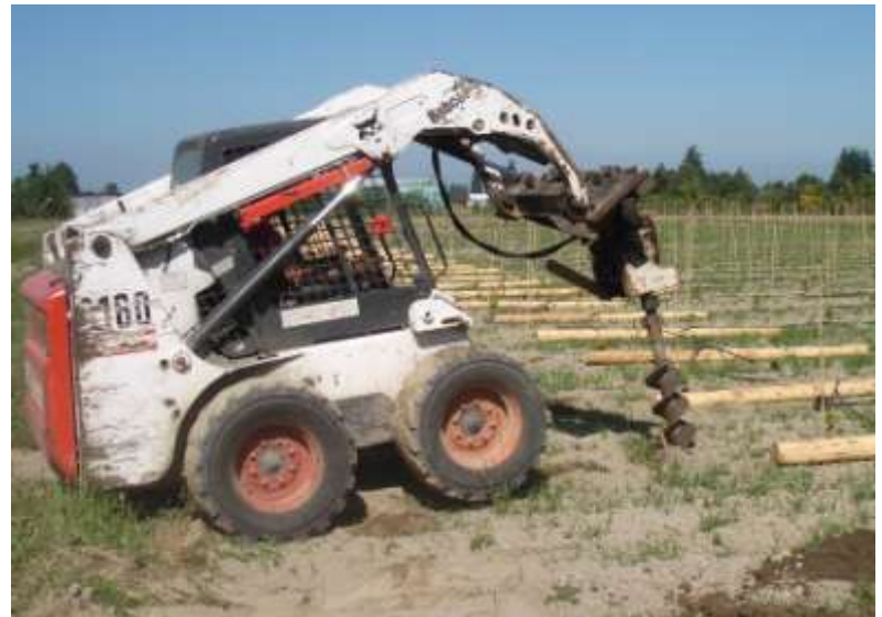
Figure 1. Drilling postholes for end posts

http://juniper.oregonstate.edu/bibliography/documents/phpKKcnVf_post-farm.pdf.