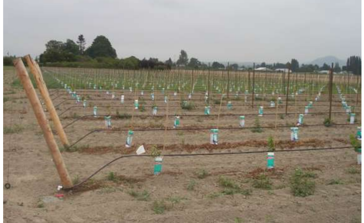
Figure 9. Organic wine grape vineyard at WSU Mount Vernon NWREC, August 2009.

Fasteners: Two commonly used types of wire fasteners are the crimping sleeve and the gripple . Inexpensive crimping sleeves are effective for splicing wires, requiring only a crimping tool, and in-row spool type wire tighteners to adjust wire tension. A gripple splices smooth wire up to six times faster than traditional methods for joining smooth wire. Inside the gripple, each wire moves in only one direction, passing over high precision gear-tooth rollers. The moment any load is applied in the opposite direction, the rollers bite, locking the wire. Recommended for inline splices, loop anchoring and repairs on trellis lines up to 500 ft. long, this system requires a gripple tensioning tool to pull the wire effectively through the fastener to the required tension.