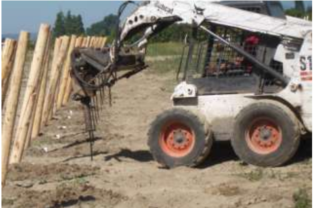
Figure 8. Drilling in post anchors