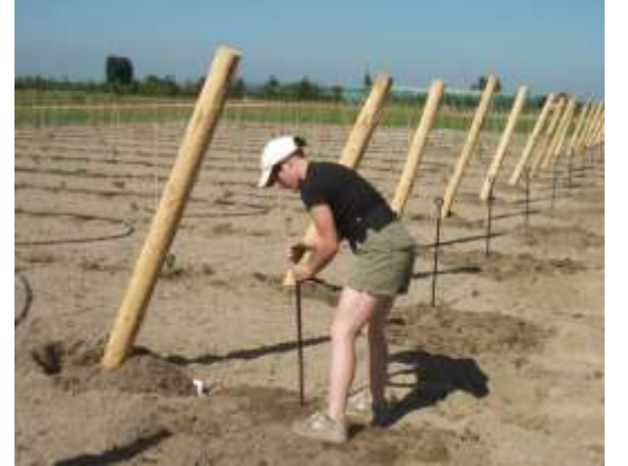
Figure 7. Setting post anchors

Anchors used to brace the end posts should be of high quality steel with a center or offset eye and helix plate. Angle and depth of setting depends on the method of bracing and on soil type. Install anchors in line with the wire, so the offset eye is just above the ground. Install anchors by hand using a rod, crow bar, or length of pipe. If the ground is very hard, dig a hole to a depth about <sup>1</sup>/<sub>2</sub> the length of the anchor, then turn the rest of the way by hand. Earth anchor adaptors can be used on post hole augers for mechanical installation (Figures 7 and 8).