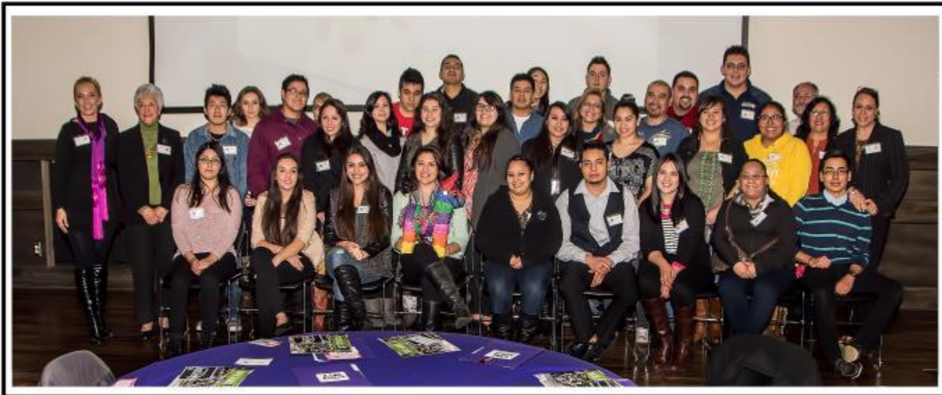
Latino Leadership Initiative 2015