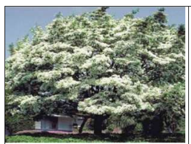
Chinese Fringe Tree

Oxydendrum arboreum Size: 20' - 25' x 10' - 15' Zone: 5 Shape: Pyramidal, drooping branches Foliage: Green Flower: Fragrant, lily-of the valley like Foliage in summer Fall color: Red - purple Comments: Prefers soils of 7.2 or less. Slow growing.