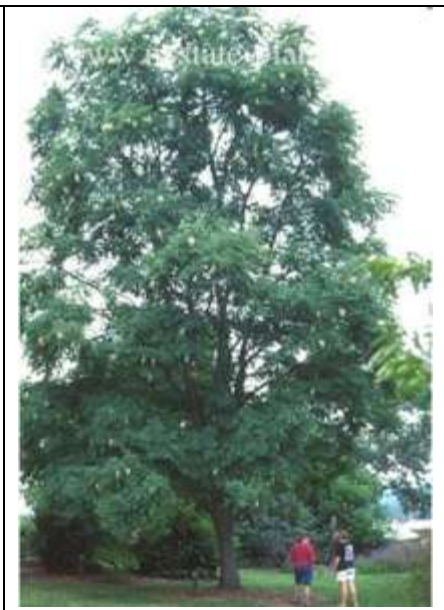
Kentucky Coffee Tree

Size: 50' - 60' x 25' Zone: 5 Shape: Pyramidal Foliage: Green blue, awl Shaped needles Flower: Cone Fall color: Bronze Comments: Smaller popular cultivars 'Yoshino' (15'-25' x 10'-15')- as shown