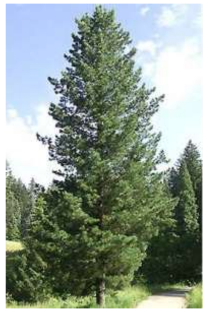
Silver Whisper Swiss Stone Pine

Pinus cembra 'Silver Whisper' Size: 12' x 6' Zone: 3 Shape: Columnar Foliage: Green 5 needle Flower: Cone Comments: Slow growing