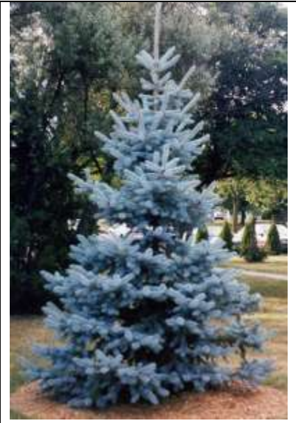
Colorado Blue Spruce

Picea pungens 'Hoopsii' Size: 30' - 60' x 10' - 20' Zone: 3 Shape: Pyramidal Foliage: Blue/green needle Flower: Cone Fall color: NA Comments: Smaller cultivar - Fat Albert (15')