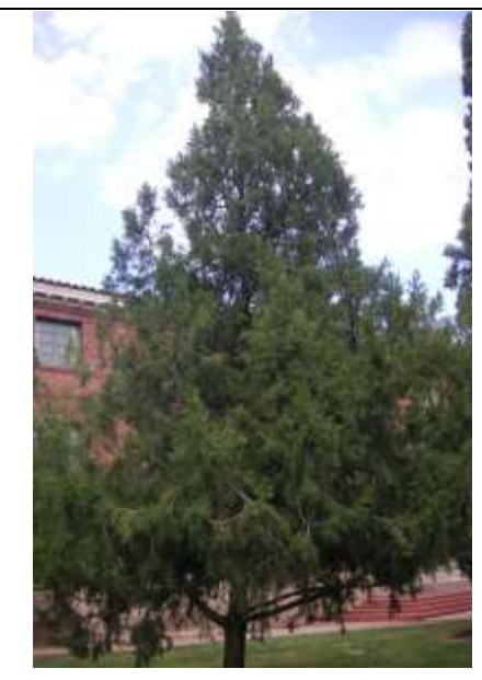
Eastern Red Cedar

Abies Concolor Size: 50' - 75' x 25' Zone: 3 Shape: Pyramidal Foliage: Blue needles Flower: Cones Fall color: NA Comments: cultivar 'Candicans'