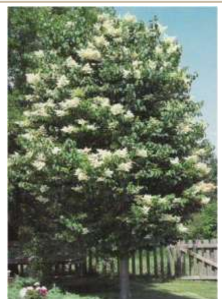
Japanese Ivory Silk Lilac

Stewartia pseudocamellia Size: 20'-30' x 20'-30' Zone: 5 Shape: Pyramidal to oval Foliage: Green Foliage: 2.5" white Fall color: Yellow/red/purple Comments: Attractive exfoliating bark, avoid hot afternoon sites .