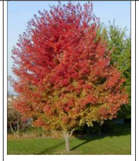
Autumn Blaze Maple

Cercidiphyllum japonicum Size: 40' x 40' Zone: 5 Shape: Upright, pyramidal when young, rounded with age Foliage: blue green Flower: NA Fall color: yellow to apricot Comments: Thin bark can sunburn. Compacted soil can be a problem.