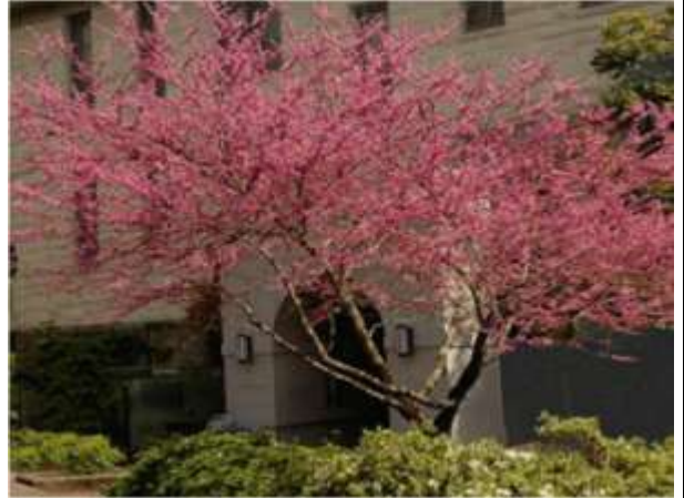
Forest Pansy Redbud

Chionanthus retusus Size: 20' x 20' Zone: 5 Shape: Broadly oval Foliage: Deep green Flower: White, snow-like, in large clusters in late spring (as shown) Fall color: Bright yellow