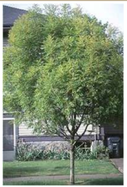
Golden Desert Ash

Pinus cembra 'Silver Whisper' Size: 12' x 6' Zone: 3 Shape: Columnar Foliage: Green 5 needle Flower: Cone Comments: Slow growing