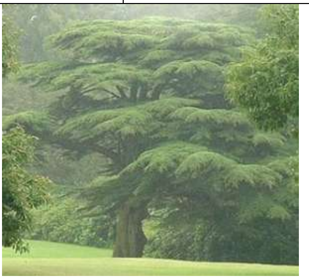
Cedar of Lebanon

Golden Rain Tree Koelreuteria paniculata Size: 35' x 30' Zone: 5 Shape: Rounded Foliage: Dark green Flower: Yellow in summer, pods Fall color: Yellow/orange Comments: Tolerates drought, heat, wind, and air pollution