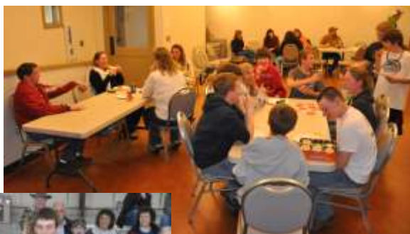
← Dudes & Diggers Family Fun Night! →