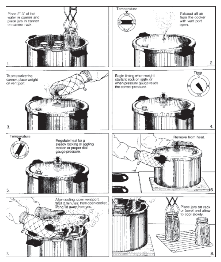
Fig. 2. Steps for using your pressure canner.

5. Regulate the heat under the canner to maintain a steady pressure at or slightly above the correct gauge pressure. The correct gauge pressure must be maintained for the entire processing time. If the pressure drops below the target pressure, reset your timer and process for the entire recommended processing time. Quick and large pressure variations during processing may cause jars to lose liquid. Generally, weighted gauges on Mirro canners should jiggle about two or three times per minute. On Presto canners, the weighted gauge should rock slowly throughout the