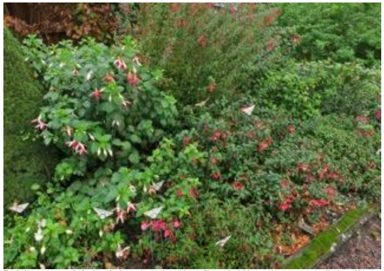
Fuchsias are nature's feeders for hummingbirds and butterflies and yield a continuous summer display of blooms. These garden workhorses have a long flowering season and little need for care.

Fuchsias are heavy feeders and benefit from a monthly application of a complete, balanced water soluble fertilizer (20-20-20) when the plant is actively growing and flowering. Alternatively, a granular, slow release fertilizer sprinkled around the shrub and watered in can be substituted but used less frequently and in accordance with package directions. Water when the soil 1" below the surface feels dry. For a bushier, compact plant with more blooms, pinch off the tips of growing fuchsia branches in late April or early May. Stop pinching once flower buds begin to develop. Cut off faded flowers to encourage more blooming and keep the fuchsia from devoting energy to seed production.