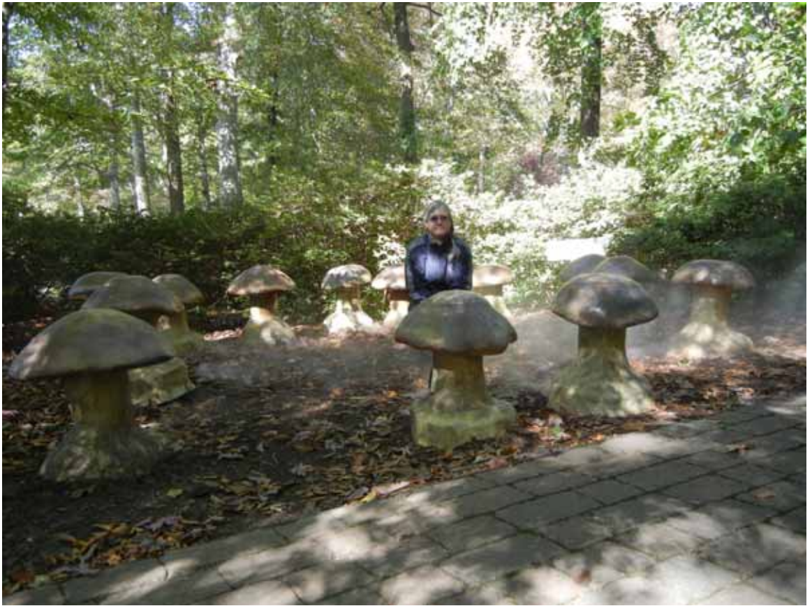
The author enjoying a modern take on "water jokes" in the fairy ring in The Enchanted Forest at Winterthur, Pennsylvania.

Information: Call 360-428-4270 ext. 0 for additional information