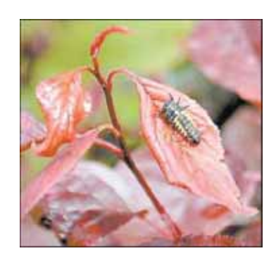
Left: Hoverflies look similar to bees with their black-and-yellow coloration. They like flowers too. Center: A Bow-area ladybug. Lady beetles (aka ladybugs) are beneficial insects that help control aphids and other harmful insects in gardens. Right: A ladybug larvae rests on the leaf of a flowering plum tree. Larvae look like tiny alligators and eat more aphids than adult ladybugs.

ROVE BEETLE - Rove beetles are completely harmless, though they may raise their abdomen as if they had a "stinger." They are recyclers of dead and decaying matter and also feed on insects found in decaying matter, such as maggots. They vary in size from 1 /8-inch to 1-inch long. Most are long, slender and colored black or brown.