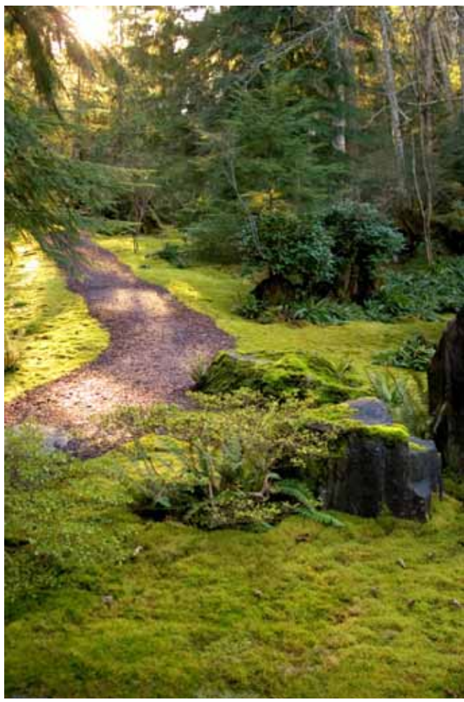
Variegated moss brightens the entrance to the Moss Garden at the Bloedel Reserve on Bainbridge Island.

Reproduction involves two generations of mosses. The first, called gametophytes, are male or female. The female plants provide an egg cell at the top, while male plants develop sperm cells. These cells swim through the film of water on the moss, to find and fertilize the egg cells.