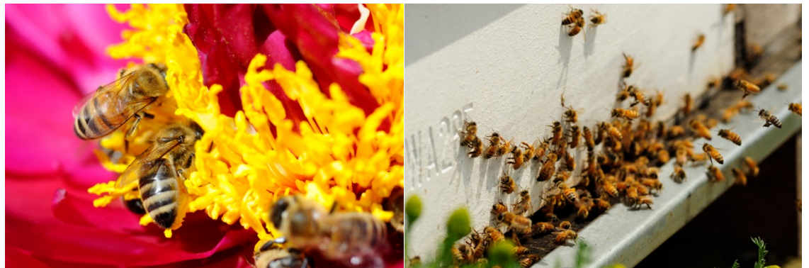
Left: These honeybees are feasting on the abundant pollen of a peony. Providing a diverse diet in the vicinity of a hive will help to improve the overall health of the bees. Right: Agriculture is extremely dependent on a good supply of healthy bees. Without the help of the insect world we would not be able to grow healthy food for ourselves.