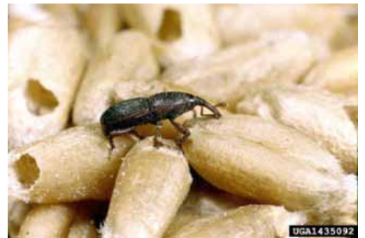
The 1/8 inch long adult granary weevil likes to eat stored grain, such as these wheat kernels.

Like other weevils, these also have a long slender snout with sharp jaws at the tip. They are small weevils, only about 1/8 inch body length. The female granary or rice weevil chews a small hole in a kernel of wheat, corn, rice or other grains and lays one egg in it. She then seals the opening with a glue-like substance. She can lay as many as 250 eggs in her lifetime of eight months! In a warm environment the weevil can complete its growth from egg to adult in four weeks. Do the math!!--WOW!