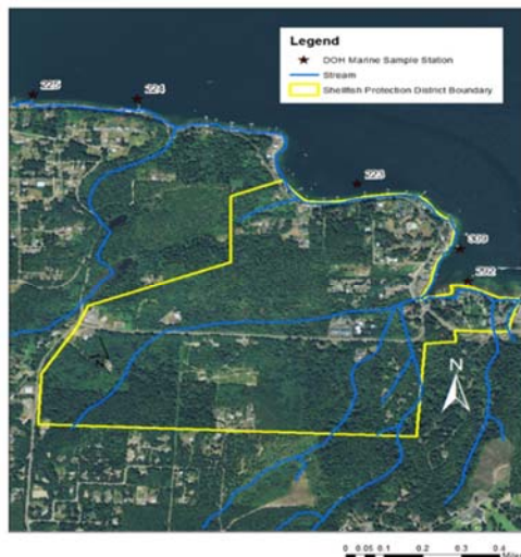
McLane Cove SPD boundaries in right figure.

The Water Resources Program will participate in each of the Shellfish Protection Districts (SPD) formed as a result of these downgrades. The SPDs bring together community residents, government agencies, shellfish growers, tribes, and other interested parties to identify and correct the sources of pollution. The Water Resources Program can assist through educational efforts on the potential sources of pollution and general best management practices for properties in the affected watersheds.