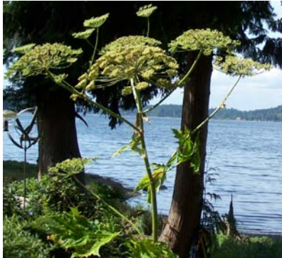
New giant hogweed site

Activity and the weather continued to heat up during the month of July for the Mason County Noxious Weed Control program. The town of Tahuya hosted the Tahuya Day Celebration on July 4 and over 80 participants at the event visited the noxious weed booth. This type of public education continues to produce results as a new giant hogweed site was reported to the program and, with cooperation from the landowner, initial treatment at this waterfront property was implemented.