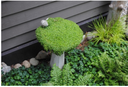
Bird bath repurposed as a planter

Visitors learned about beekeeping, raising fowl, how to conserve water in the garden and use repurposed objects to decorate the garden. Master Gardener volunteers were on hand to answer questions and point out the more unusual plants and other items in the gardens. Next year's tour will focus on the Union area, with Harmony Hill Cancer Retreat Center already agreeing to be included.