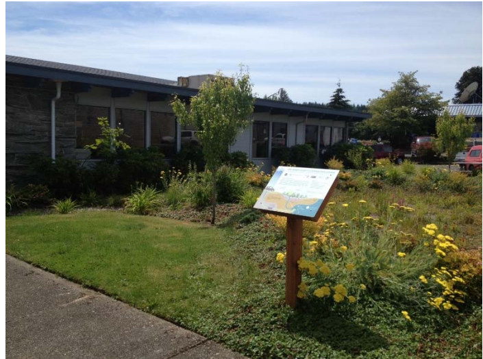
Rain Garden outside of WSU Mason County Extension Office

WSU has submitted an NTA proposing to expand the Stormwater Stewards program throughout South Puget Sound. This program currently exists in Thurston County and is a capacity-building program in which capable, committed, and well trained citizen volunteers provide peer-to-peer technical assistance to other residents seeking opportunities to manage and treat polluted runoff on their home or small commercial sites through design and installation of low impact development techniques including rain gardens and permeable pavers.