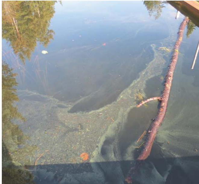
Early January algae bloom on Spencer Lake

https://www.facebook.com/SpencerLakeAquaticInvasiveSpecies/?ref=hl .