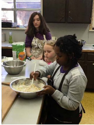
4-H members learning how to make dinner rolls

Mission: 4-H Youth Development empowers youth to reach their full potential, working and learning with caring adults.