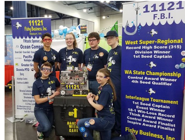
Robotics Team 11121 Fishy Business Inc. with their robot

Great things are happening with a team of curious and creative students and adults in Ocosta! The 4-H Robotics Team 11121 Fishy Business Inc. (FBI) has spent the past few months preparing to meet the challenge set forth in this year's FIRST FTC challenge "Velocity Vortex". Combining the excitement of sport with the rigors of science and technology, robotics is the ultimate sport for the mind. After returning from a successful trip to the Interleague Tournament as 1st Seed Captain and receiving the Think Award,