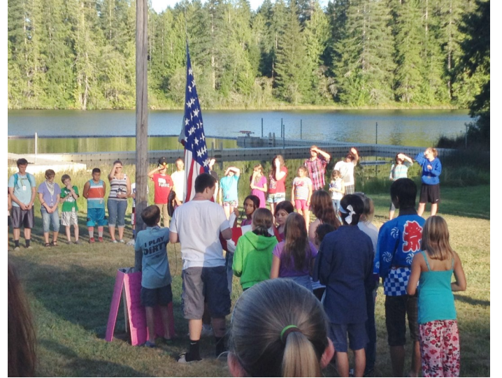
The daily flag ceremony at Panhandle imparts a sense of tradition and respect as campers gather lakeside.

Summer is just around the corner and that means it's almost time for 4-H Summer Camp at Panhandle Lake! 4-H camp provides an environment where youth, under the guidance of positive role models, take part in a personal growth experience that emphasizes community building, positive social interactions, environmental awareness, skill building, and fun. Campers spend the week enjoying a myriad of activities, including swimming, hiking, arts, music, cooking, and making new friends! For many of the younger campers this is the first time away from home and family so the first couple of nights there may be a few cries to go home but by the end of the week they are "crying" because they don't want to leave. Our expert camp staff support, guide, and teach campers through new experiences. All counselors and adult volunteers are required to attend training sessions that provide them with the skills to confidently care for the campers. Many adult camp staff members attended 4-H camp as a youth and are now serving as volunteers and counselors to the next generation. The traditions and adventures of Panhandle run deep, be prepared to