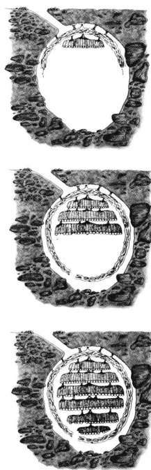
Figure 2. Yellowjacket nest in spring (top), summer (center), and early fall (bottom).

sometimes leads to a wet patch that develops into a hole in a wall or ceiling.