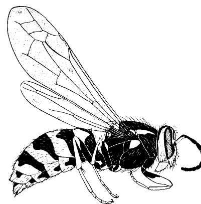
Figure 1. Western yellowjacket.

The term yellowjacket refers to a number of different species of wasps in the genera Vespula and Dolichovespula (family Vespidae). Included in this group of ground-nesting species are the western yellowjacket, Vespula pensylvanica , which is the most commonly encountered species and is sometimes called the "meat bee," and seven other species of Vespula . Vespula vulgaris is common in rotted tree stumps at higher elevations and V. germanica (the German yellowjacket) is becoming more common in many urban areas of California, where it frequently nests in houses. These wasps tend to be medium sized and black with jagged bands of bright yellow (or white in the case of the aerial-nesting