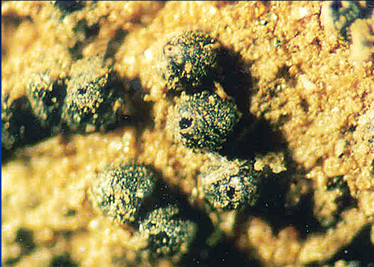
Fruiting Bodies Melanized pseudothecia Leptosphaeria sp.