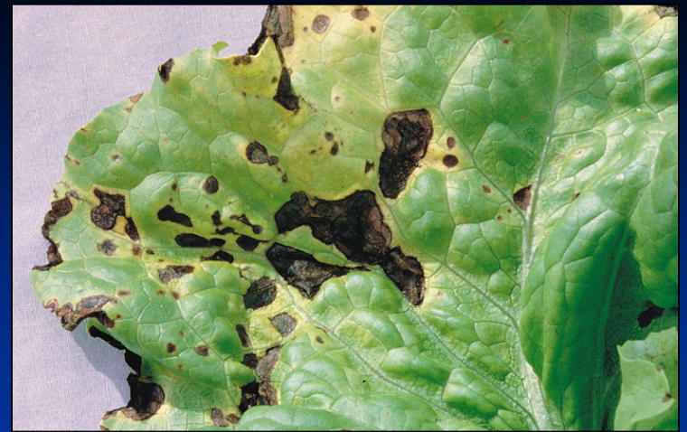
Bacterial Leaf Spot