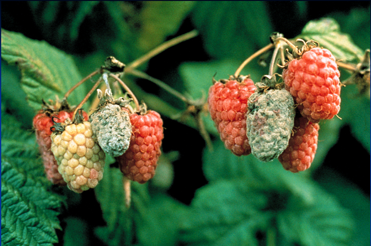
Gray Mold on red raspberry spores Botrytis cinerea