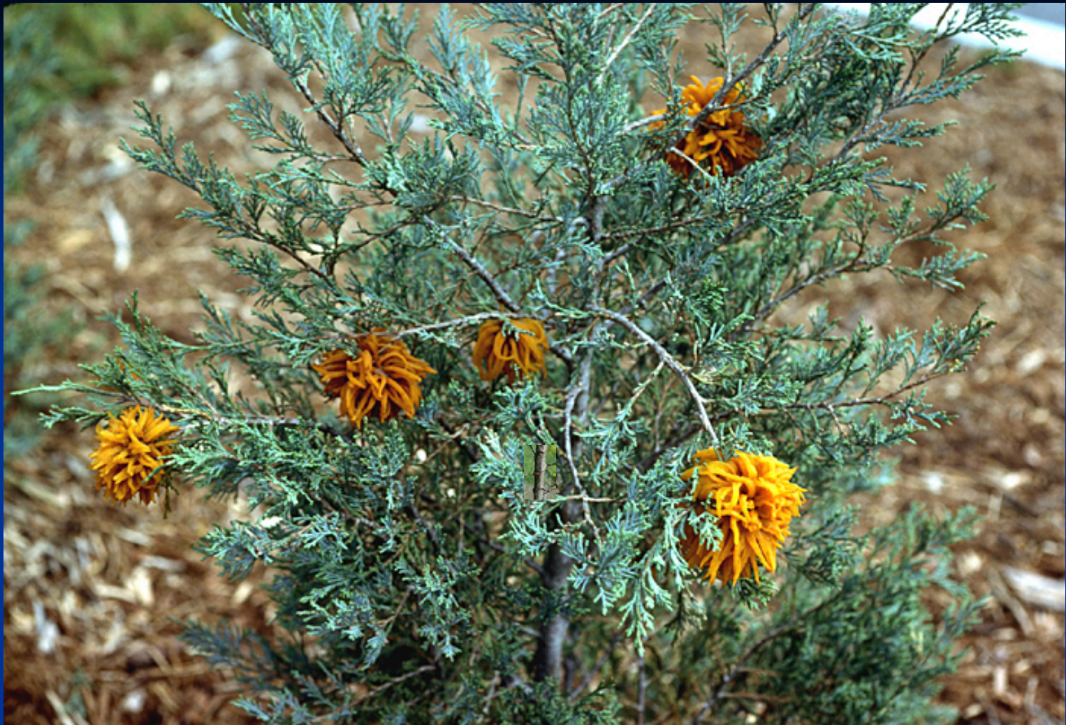
Telial galls (spore horns) Cedar-apple Rust Gymnosporangium sp.