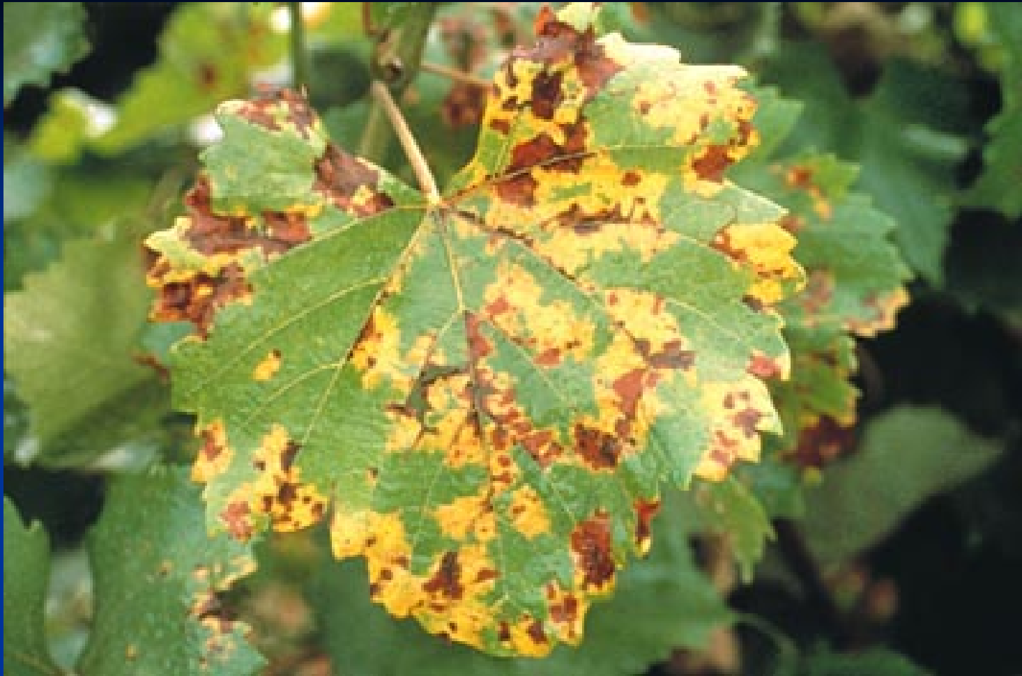
Bacterial Leaf Spot