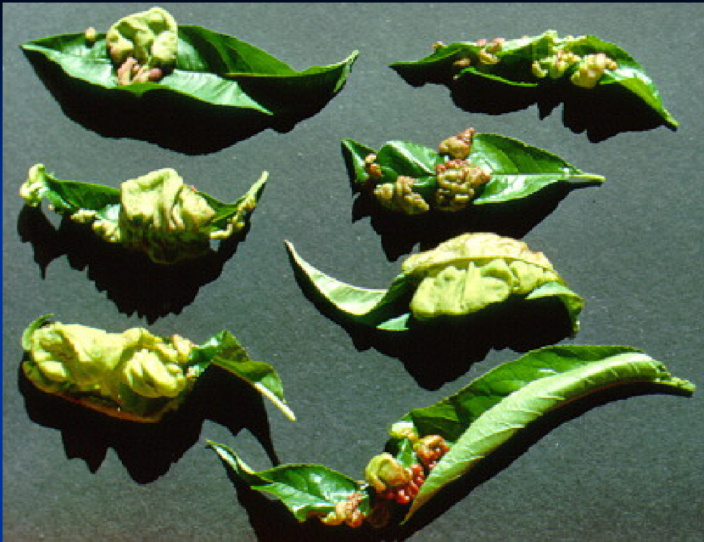
Peach Leaf curl Taphrina deformans