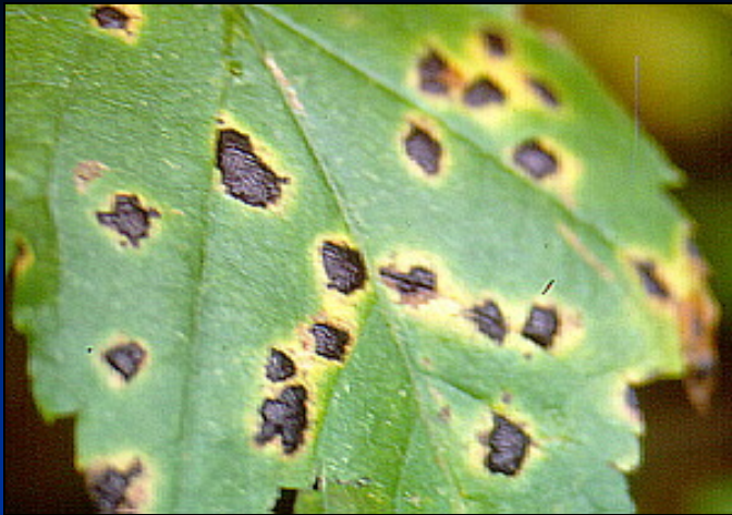
Fungal Leaf Spot