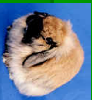
American Fuzzy Lop